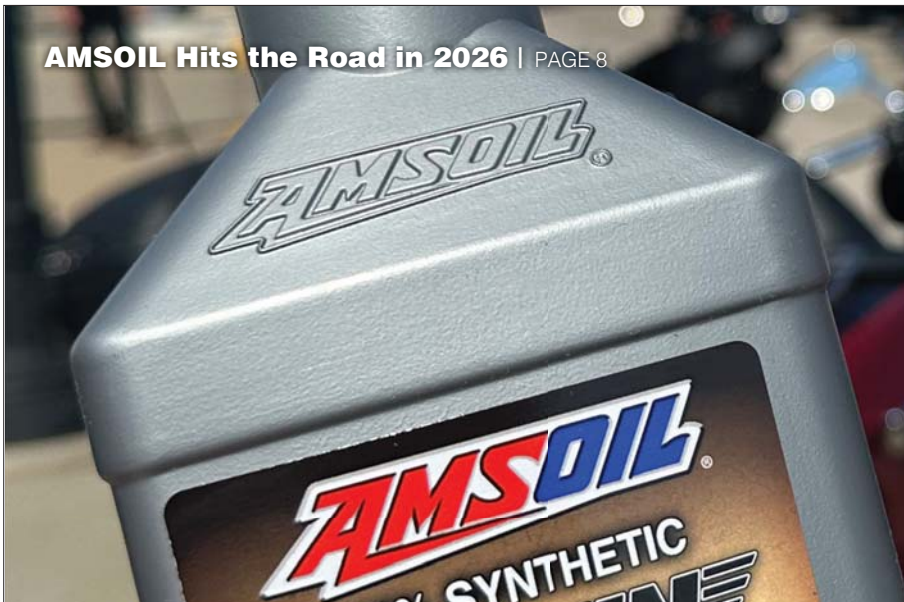
AMSOIL Hits the Road in 2026 | PAGE 8